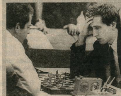
THE YEARS BETWEEN: A young Fischer and rival Boris Spassky go eyeball-to-eyeball 20 years ago — and in their $5-million rematch.