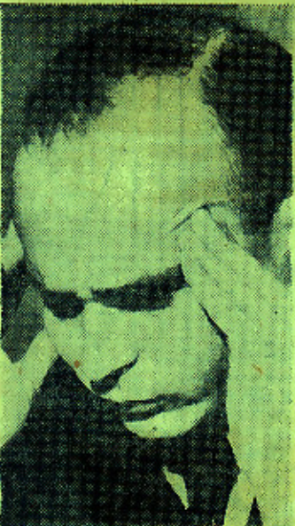
SAMUEL RESHEVSKY Defeats Soviet Chess Ace