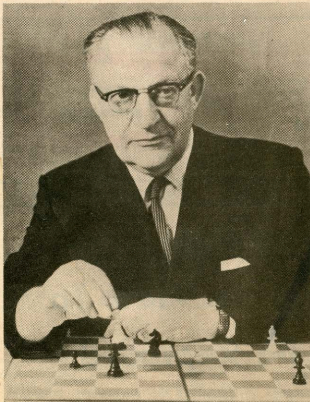
Can Anyone in Valencia Valley Beat Him?

The big event is just two days away! On Friday evening, International Master George Koltanowski will appear in The Signal's Chess Exhibition, the first of its kind in the history of this valley. Beginning at 7:30 p.m. at Cal Arts, the famous chess master will lecture on the recently-completed Fischer-Spassky match, answer all questions from the audience, play a sample blindfold game, and then perform a simultaneous chess match against 25 of the best local players. It should be an evening of excitement and entertainment for young and