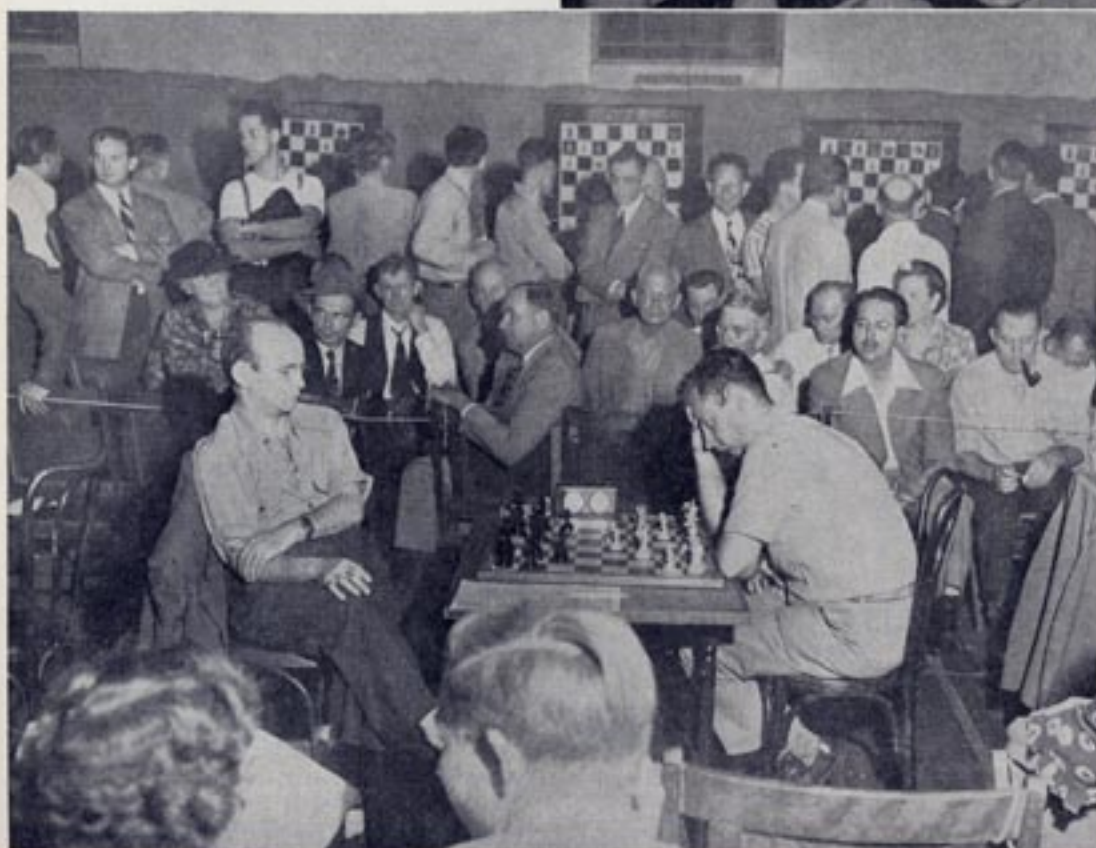
LEFT: The tense ninth-round battle between Sammy Reshevsky (left) and Reuben Fine (right) attracted a record crowd of 800 enthusiasts. Fine had a marked advantage in the early middle game, but eventually allowed Sammy to wriggle out. From move 27 on, all the moves were rapped out "blitz" style, with both players handling the game with amazing accuracy. The outcome, a draw, left Reshevsky and Fine tied for first place. In the remaining three rounds, Sammy built up a commanding lead.