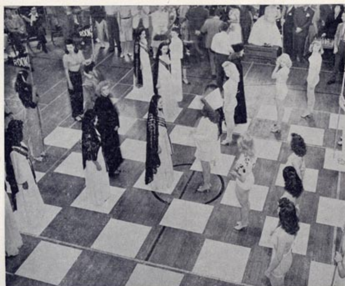
Chess glamor in the Hollywood manner: a scene from the colorful Living Game. The white Pawns are Earl Carroll girls in white bathing suits; Latin American beauties in formal gowns are the black Pawns.

Leaving a marked weakness at his Q4. But Black's choice is limited.