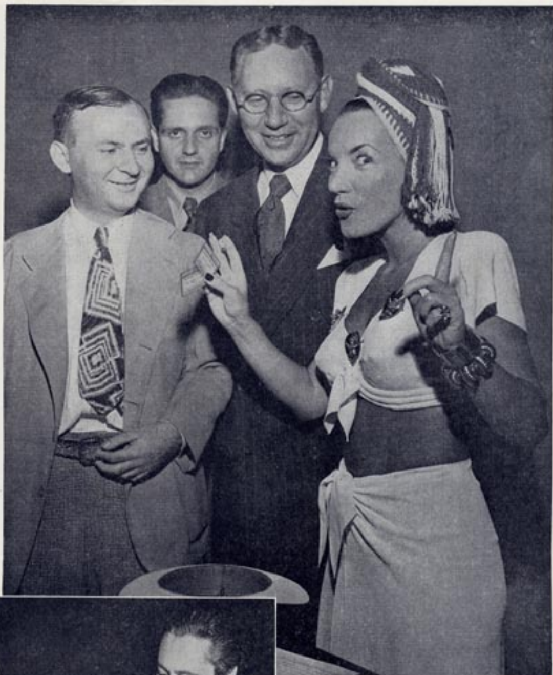
ABOVE: In keeping with the predominant Pan-American note, Carmen Miranda was invited to draw the players' numbers for the pairing system. Her dynamic personality gives the routine ceremony a character all its own. No wonder Reuben Fine (left) grins appreciatively!

For CHESS REVIEW'S Al Horowitz, the Pan-American Congress was a unique combination of gruelling tournament chess and carefree vacationing. Horowitz naturally welcomed the opportunity to play in such