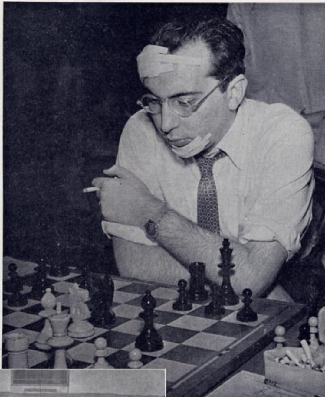
ABOVE: Herman Pilnik, Argentine ace, was badly hurt in an automobile crash while on his way to Hollywood (Chess Review, August-September, P. 8). Although he had to make up his first three games and was not fully recovered from his accident, Pilnik played excellent chess all the way, finishing only half a point behind Reuben Fine.