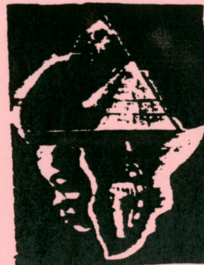
"The Mother Land"